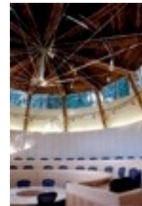
Life Sciences West Atrium Liu Institute

The Forest Sciences centre allowed room for small workshops, larger panel discussions, and a central atrium for refreshment breaks. The Liu Institute provided the perfect venue for a roundtable dialogue, and the West Atrium of the Life Sciences Centre allowed open space for career fair booths. Accommodation was also reserved for participants on site at the University of British Columbia residences.