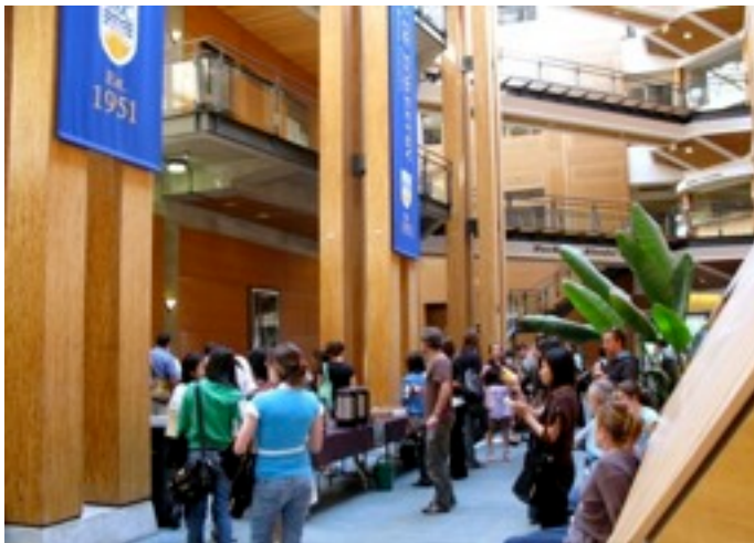
Forest Sciences Centre Atrium

Life Sciences Centre West Atrium: Exhibition and Career Fair